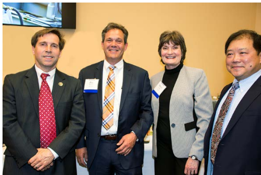
ETEBA Washington Day & House Nuclear Cleanup Caucus