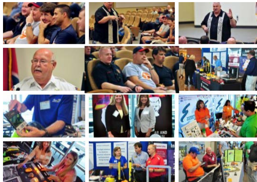
Oak Ridge Partnership Supporting the EM Cleanup Effort